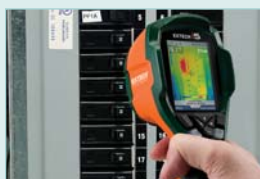
Detect hidden problems fast