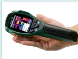
Pocket size and extremely lightweight camera only weighs 12 ounces